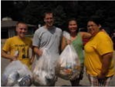
Trashy Jaycees at Hoffmaster State Park Clean-up