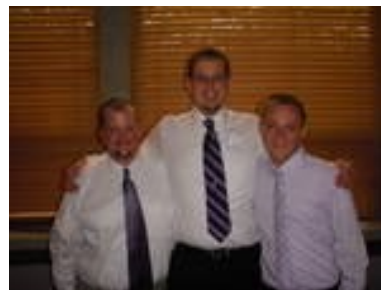
Lookin' good, gentlemen!