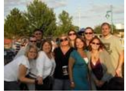
Muskegon Summer Celebration/ Be There O.A.R. Be Square