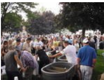
Look at that crowd!