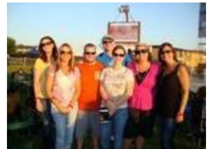
The group, possibly donning "Cheap Sunglasses" for ZZ Top?